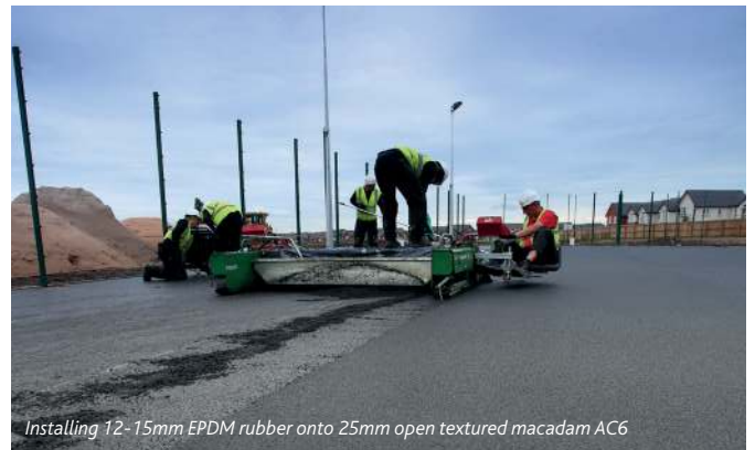
Installing 12-15mm EPDM rubber onto 25mm open textured macadam AC6