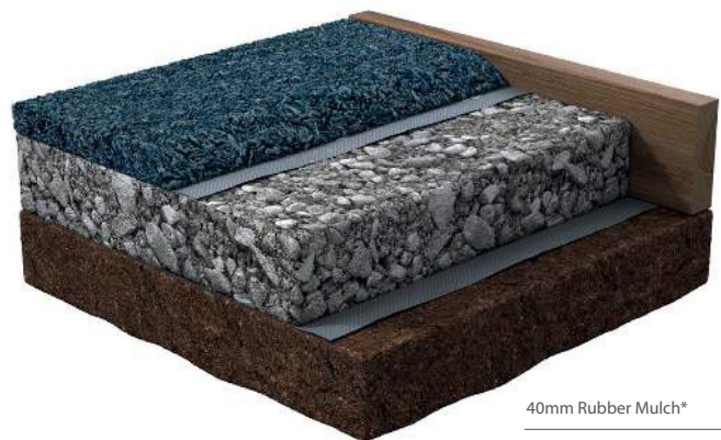
40mm Rubber Mulch*

Min 50-100mm MOT Type 1 20mm to dust (non-recycled). Laid, level and compacted to the required tolerance.