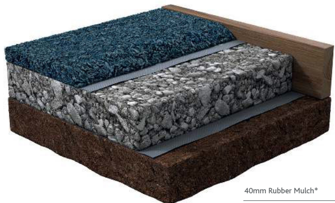
40mm Rubber Mulch*

Min 50-100mm MOT Type 1 20mm to dust (non-recycled). Laid, level and compacted to the required tolerance.