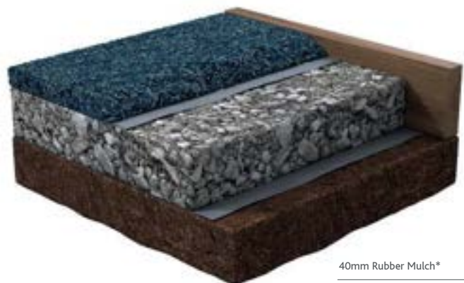
40mm Rubber Mulch*

Min 50-100mm MOT Type 1 20mm to dust (non-recycled). Laid, level and compacted to the required tolerance.